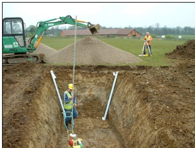
Construction of the Radar test pit, April 2002

10.00 Magnetic survey technique to 12.00 Radar Survey Technique Resistivity imaging surveys 12.00 Seismic, EM and Gravity to 14.00 techniques 14.00 Magnetic survey technique to 16.00 Radar Survey Technique Resistivity imaging surveys